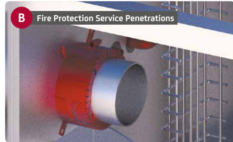
B Fire Protection Service Penetrations