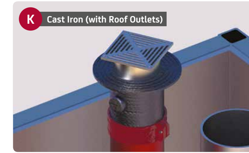
K Cast Iron (with Roof Outlets)