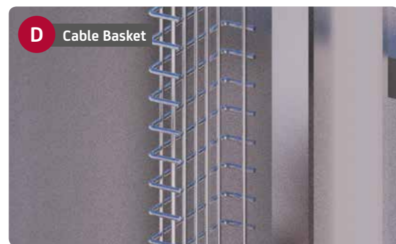
D Cable Basket