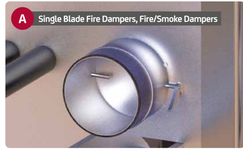
A Single Blade Fire Dampers, Fire/Smoke Dampers