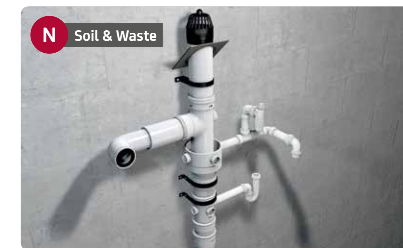
N Soil & Waste