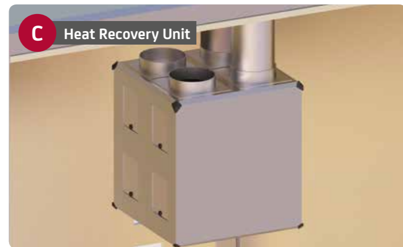
C Heat Recovery Unit