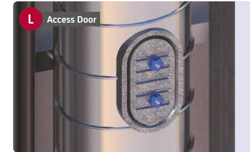
L Access Door