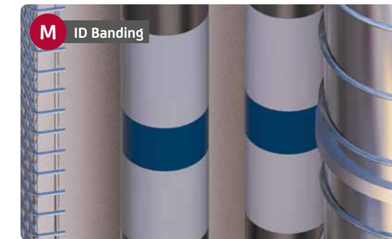
M ID Banding